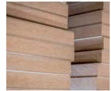
Plain MDF boards