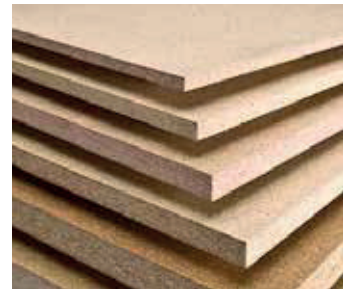
Plain Particle boards