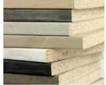
Laminated Particle boards